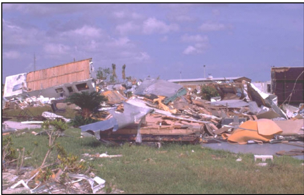
Help communities with storm clean-up.