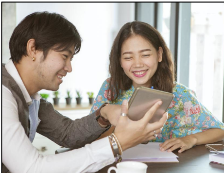
Become a tutor.