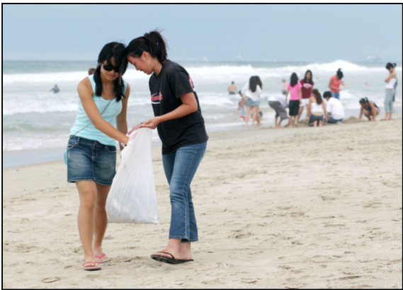
Attend a beach or river clean-up day.