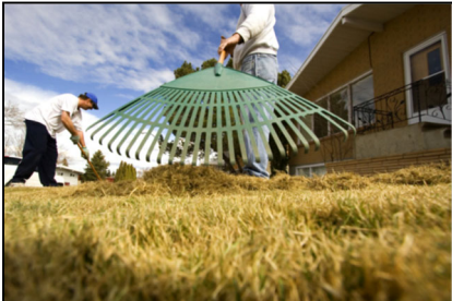
Help with city or school beautification projects.