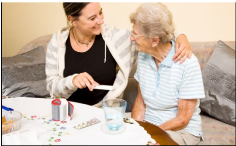
Assist the elderly at senior citizen centers.