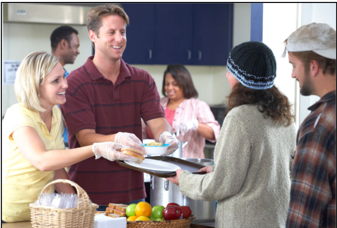
Serve or prepare meals at homeless shelters.